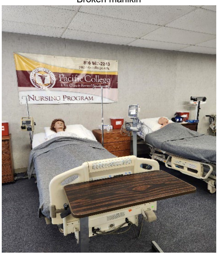
Manikins in beds in skills lab