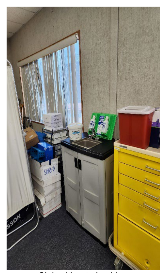
Sink without plumbing