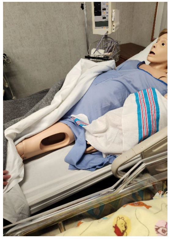
Missing injector pad