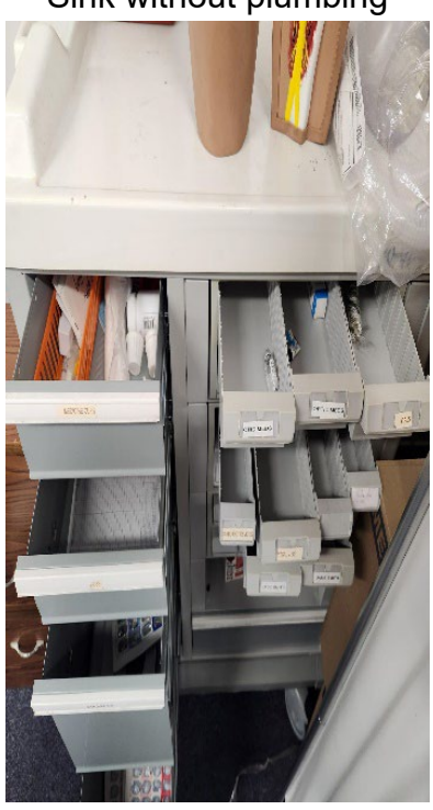
Unstocked Medicine Cart