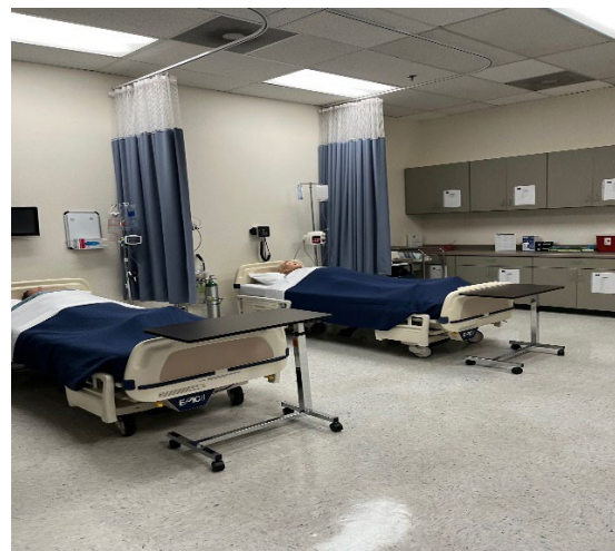
Skills lab with two manikins