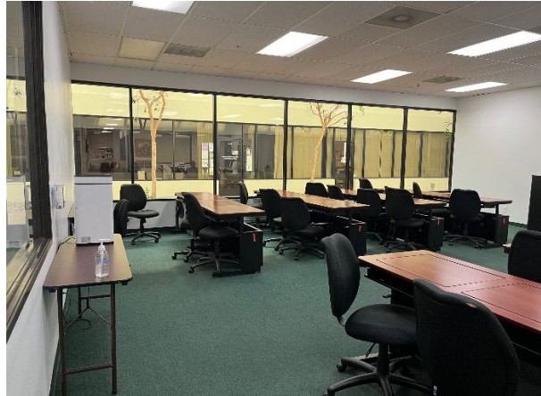
Classroom 1 with tables and chairs