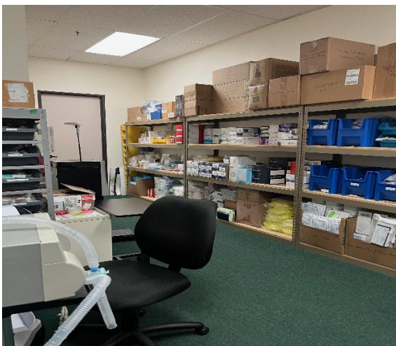
Skills lab supply room