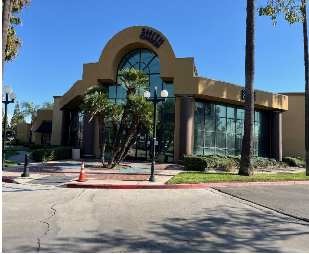
Front entrance of Smith Chason