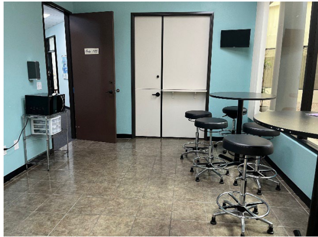
Student lounge with microwave