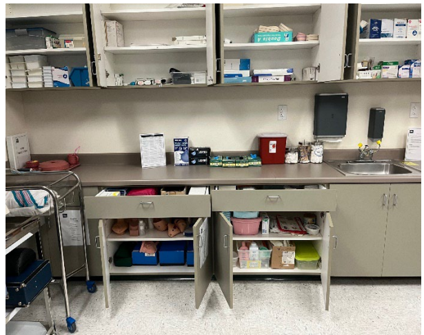
Skills lab supplies