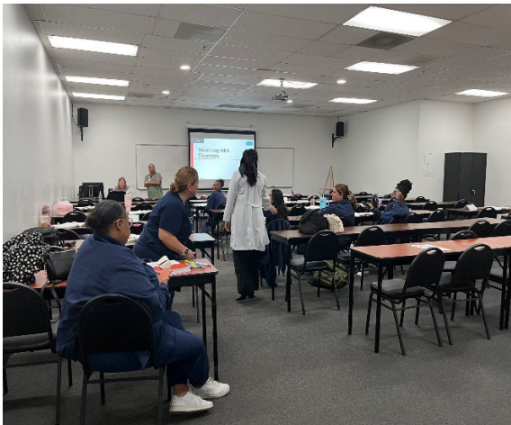
Classroom 1 with tables and chairs