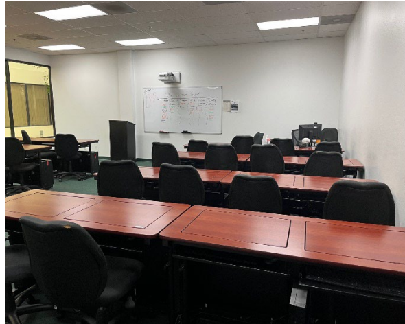
Classroom 3 with tables and chairs