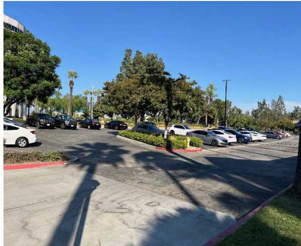
Parking lot for student parking