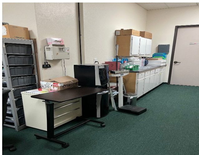
Skills lab supply room