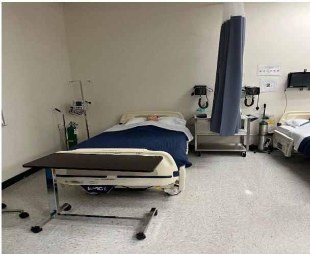
Skills lab with manikin in a bed