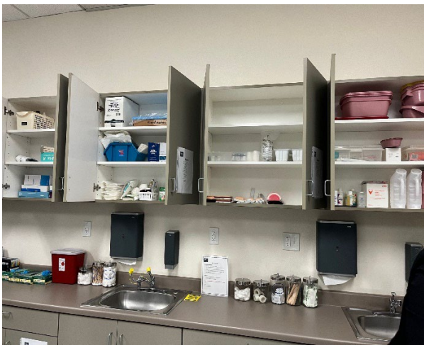
Skills lab supplies