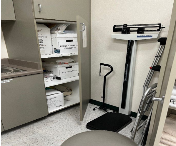
Skills lab supplies