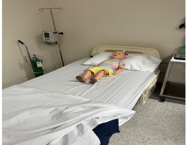
Child manikin lying on a bed