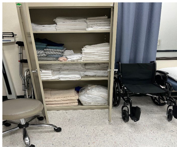
Skills lab supplies